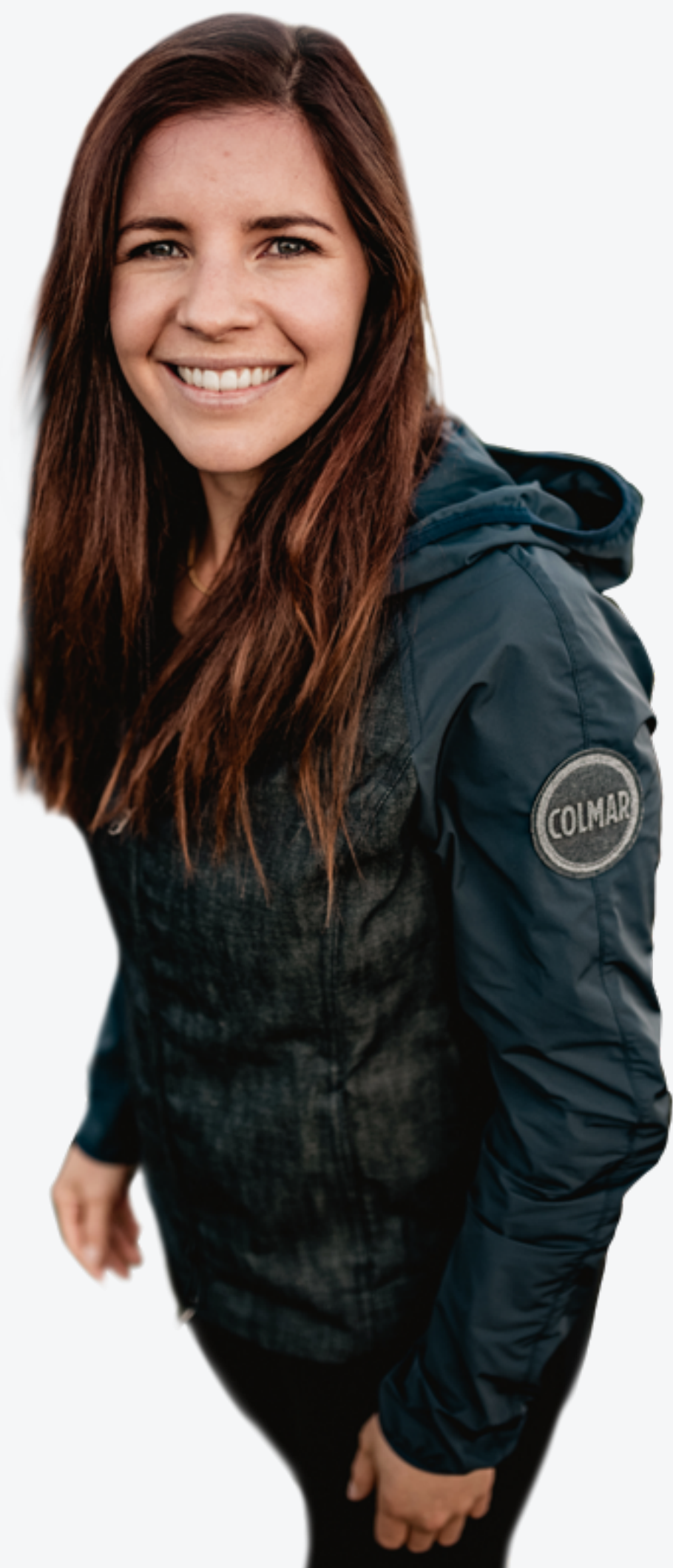
Tina Weirather, Former ski racer, Liechtenstein Ambassador